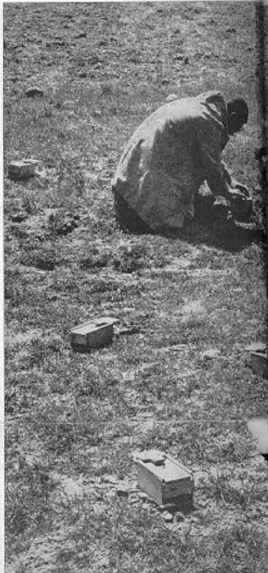
Scientist places traps to catch gerbils in study of factors involved in propagation of plague.