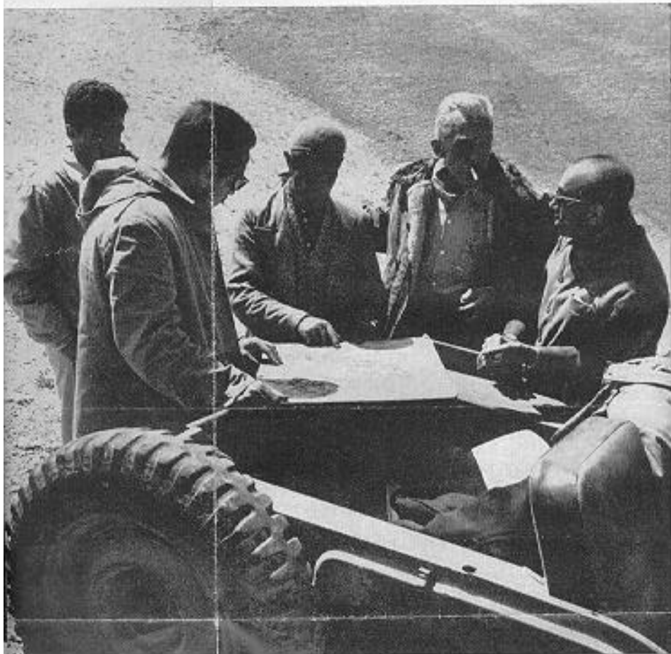
In the field with their equipment, research team members discuss their plan to catch rodents.