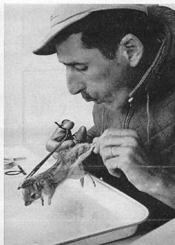
French entomologist hunts fleas on rodents. Three types are known to spread deadly organisms.