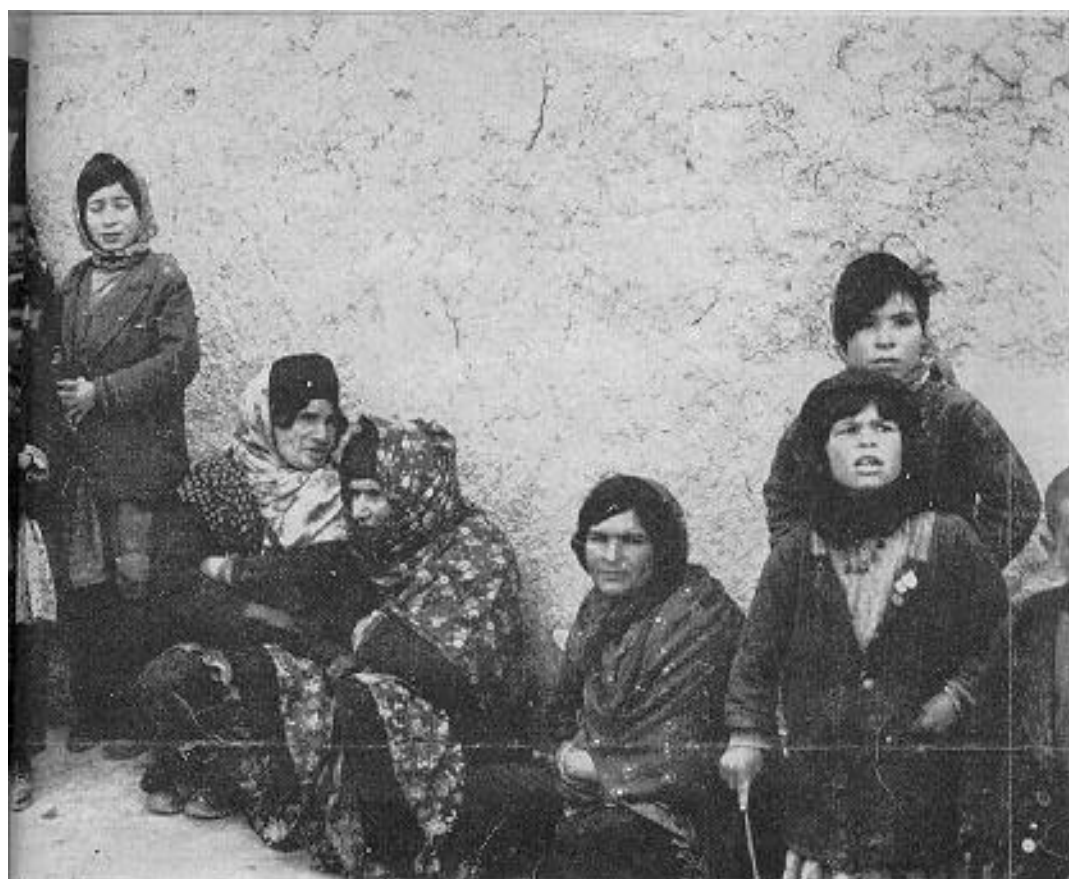
Shepherd families have not changed their living habits for centuries. Children playing in grass are often in danger of becoming infected by rodents' fleas.